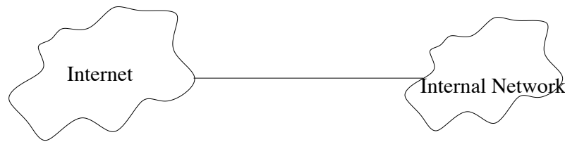
Figure 1: An example network topology, with a single link connecting the internal and external networks.